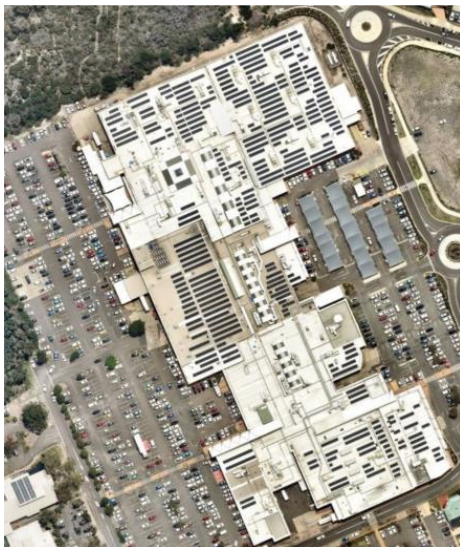
Salamander Bay NSW - 1.0MW