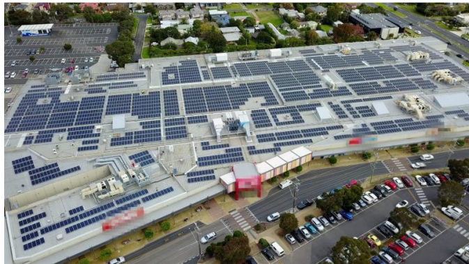
Rosebud Plaza VIC - 1.2MW