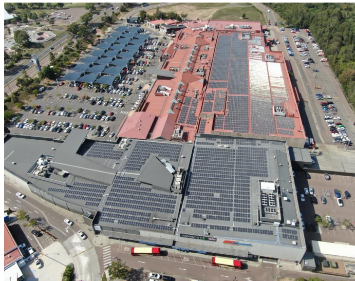
Bateau Bay NSW - 1.7MW