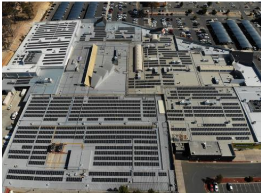
Lansell Square VIC - 1.1MW

Below is a sample of CleanPeak built solar PV systems at shopping centres around Australia: