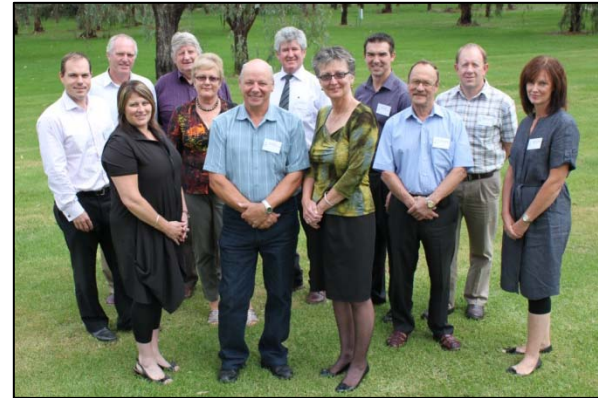
Water Plan 3 Reference Group