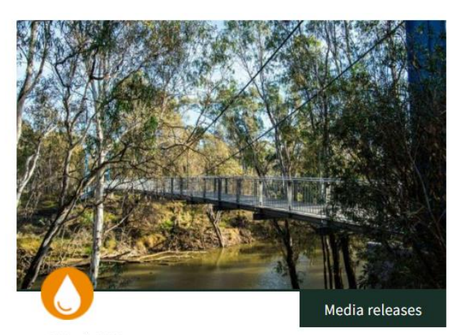
12 April 2023

The Essential Services Commission has released its draft decision on Central Highlands Water's proposed five-year pricing plan for consultation, ahead of a final decision to be issued in June.